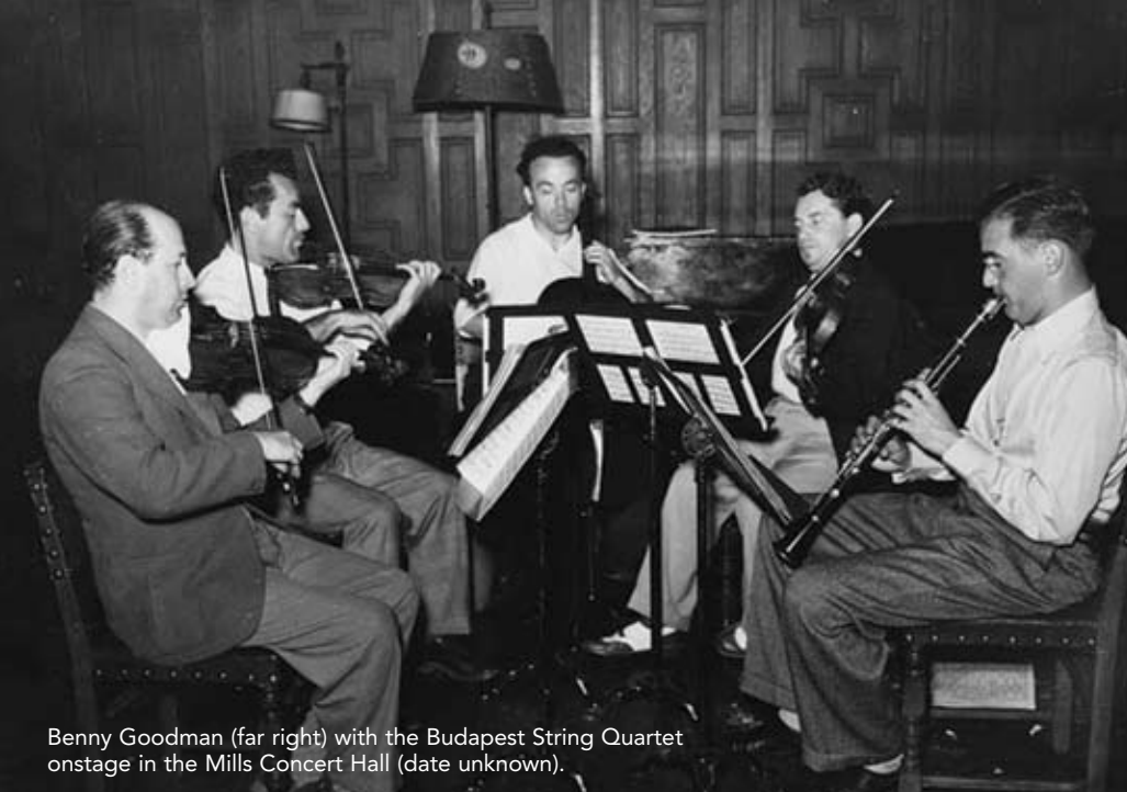
Benny Goodman (far right) with the Budapest String Quartet onstage in the Mills Concert Hall (date unknown).