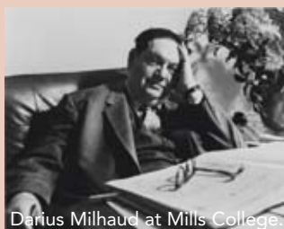
Darius Milhaud at Mills College.

“The octet was born right in Milhaud’s class,” Brubeck recalled, “when he said, ‘How many of you play jazz?’ We all started thinking, ‘Uh oh, is this going to be like all the other teachers in conservatories?’ But we raised our hands anyway, and he said, ‘All right, I’d like you to write for the jazz instrumentation,’ and that’s the way the octet was born. He got the first concert for us right there at Mills, for the girls. The guys all, well, I think quite a few romances and some marriages came out of that.”