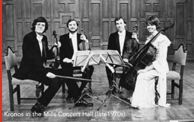
Kronos in the Mills Concert Hall (late 1970s).