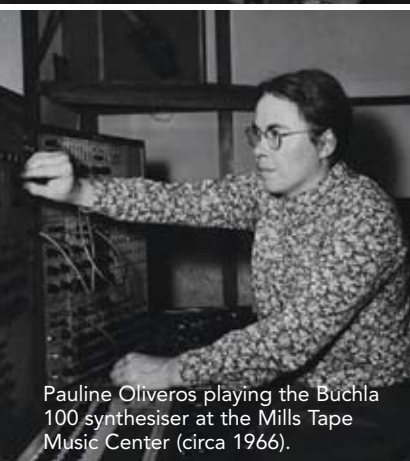
Pauline Oliveros playing the Buchla 100 synthesiser at the Mills Tape Music Center (circa 1966).