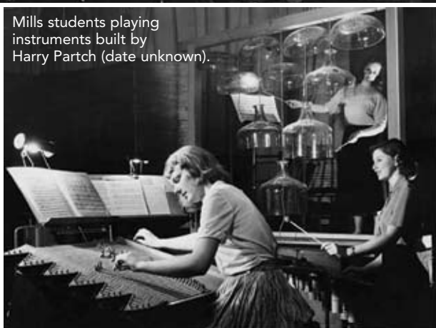
Mills students playing instruments built by Harry Partch (date unknown).