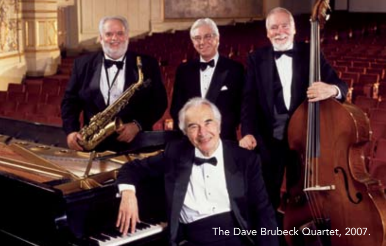
The Dave Brubeck Quartet, 2007.