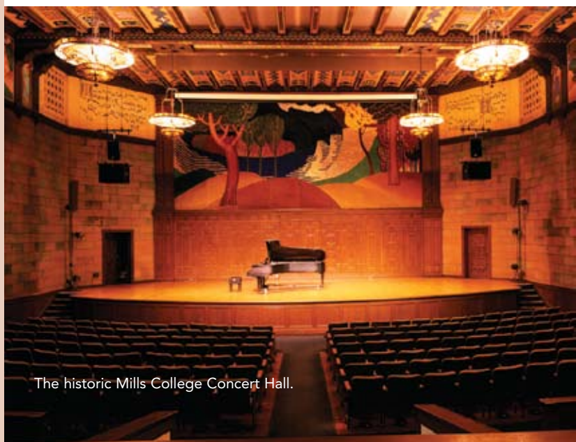
The historic Mills College Concert Hall.

Brubeck: Milhaud and Concert Hall